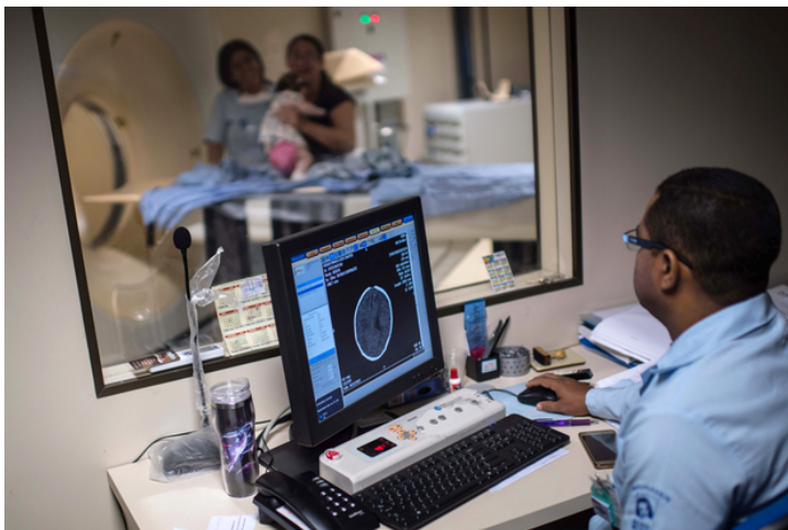
Doctors scan the brain of a newborn baby to detect a possible microcephalia in Brazil.

"That then gives the WHO the ability to start talking about perhaps travel restrictions or trade restrictions, which is very unlikely in this case, but also how they can start mobilising resources globally to address the problem. So it's a threshold point, but it's also bringing together as much information as we have at the moment."